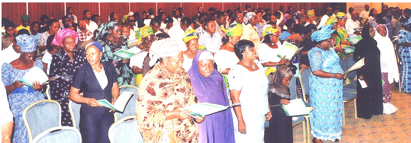
Creating of awareness Against Illiteracy in Abuja