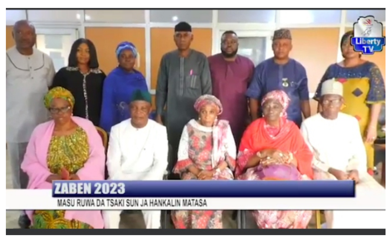
Campaign Against Electoral Malpractice in Nigeria