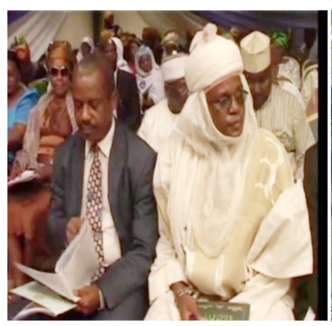
Attendance at the campaign against Illiteracy in Nigeria