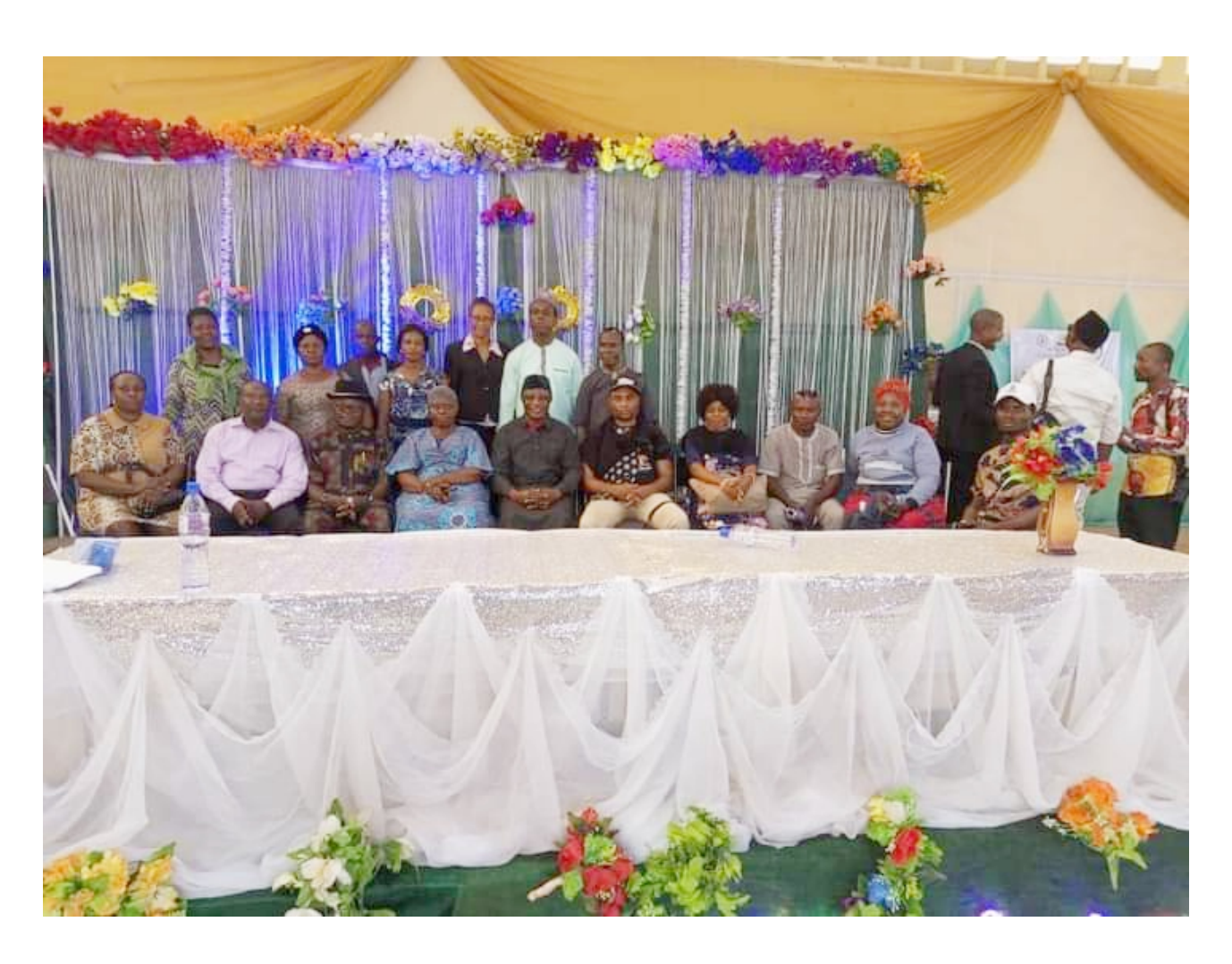
Lunching of campaign against illiteracy in Nigeria at Nnamdi Azikiwa Stadium Enugu JFMIS