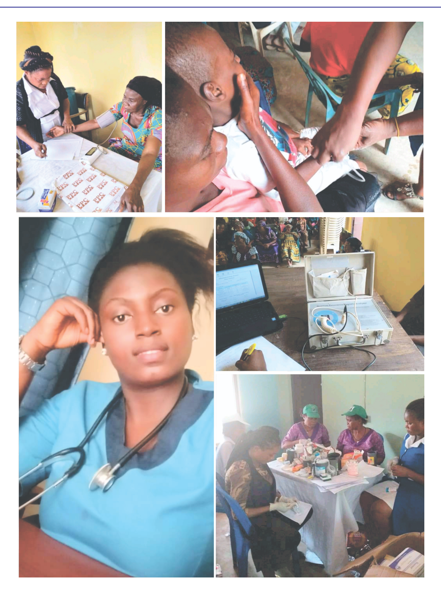
Joint Faith Mass Literacy Support program, Medical Outreach