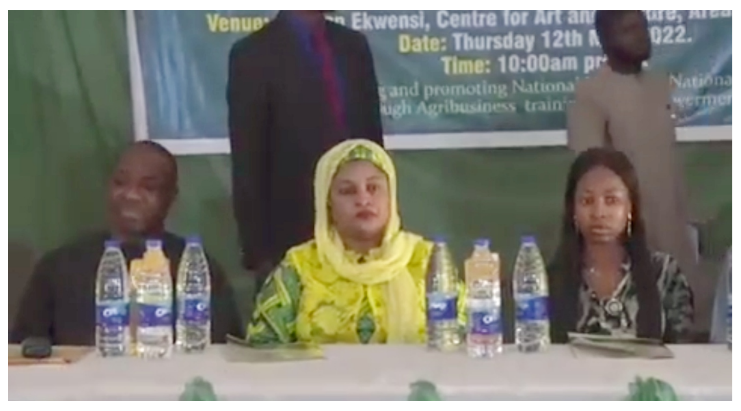
REPRESENTATIVE OF THE HON. MINISTER OF STATE DR. RAMATU TIJANI ALIYU PHD FEDERAL CAPITAL TERRITORY ABUJA