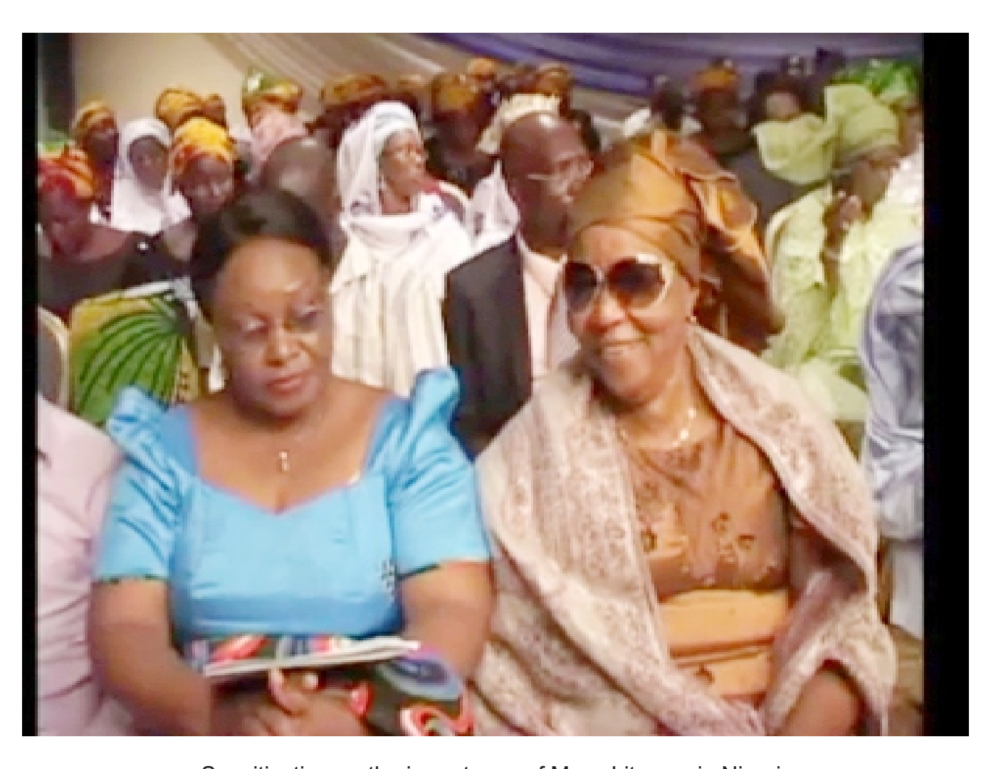
Sensitization on the importance of Mass Literacy in Nigeria