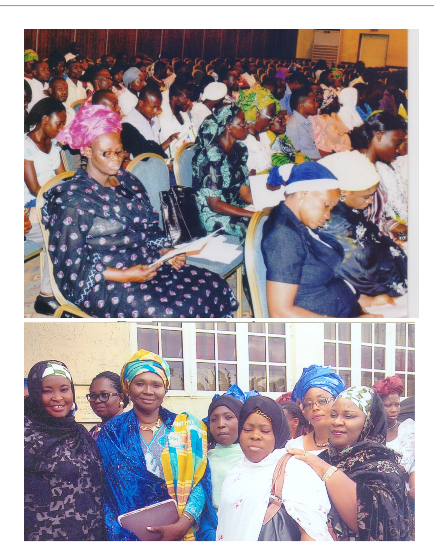
Campaign Against Illiteracy In Nigeria