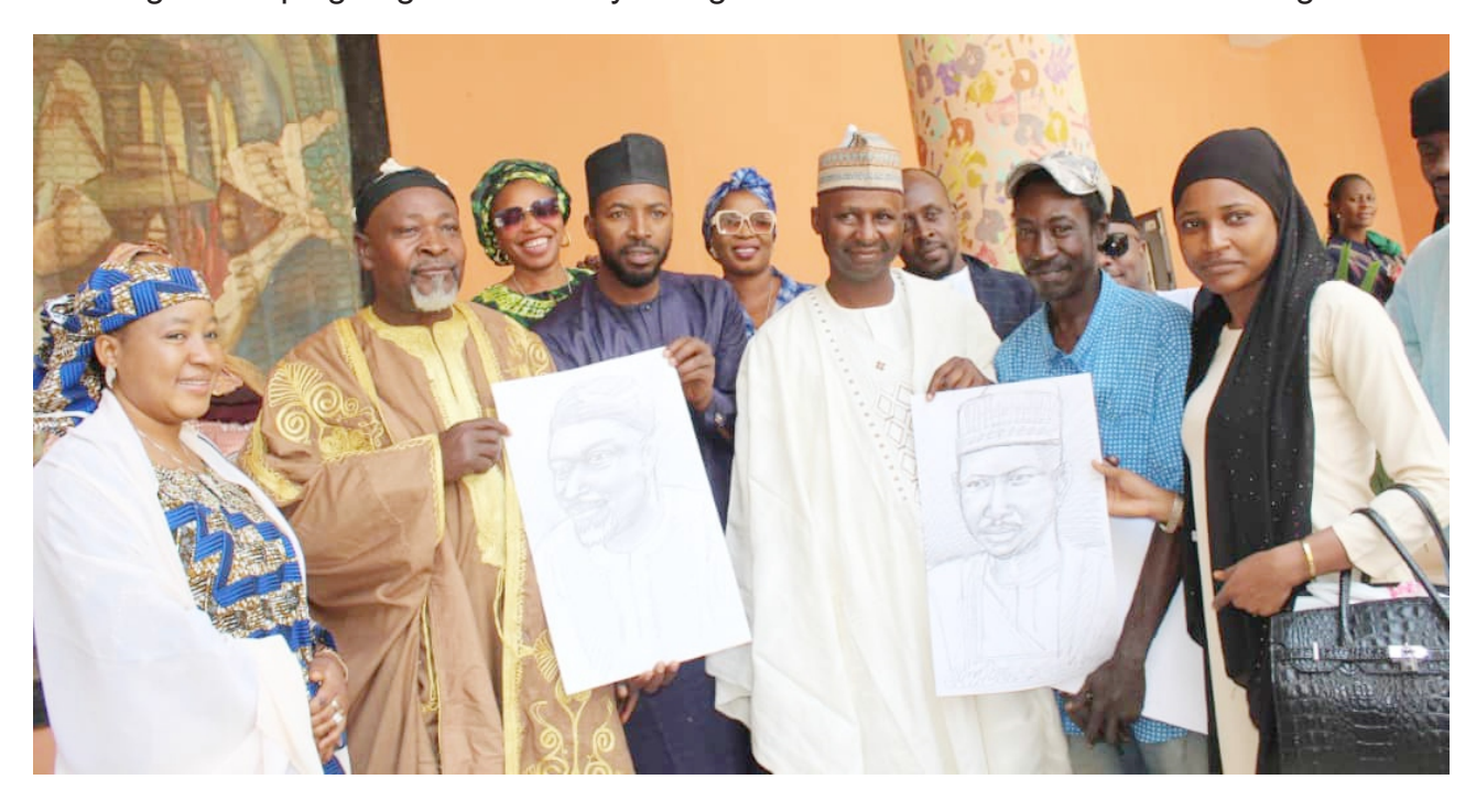
Mass Literacy awareness at Cyprian Ekwensi centre for Arts and Culture Area 10 Garki Abuja FCT